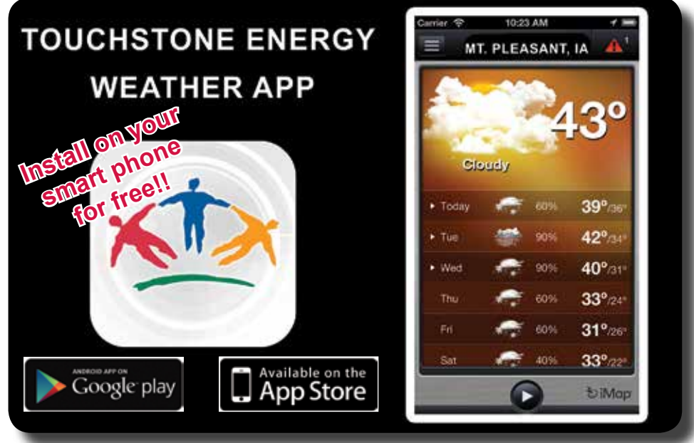
Stop in to Get Your FREE Weather Radio App Code for Your Smart Phone