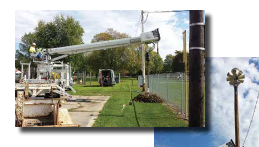
Access Energy Cooperative crew helped install the new Denmark weather sirens.