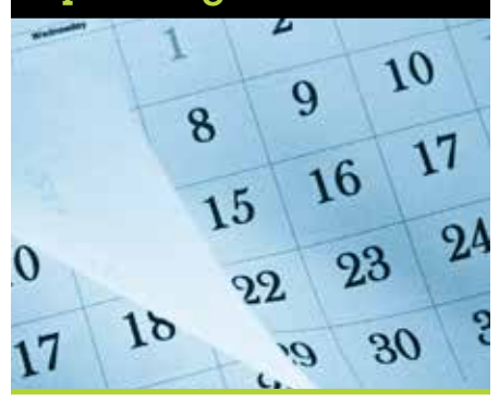
Aug. 11-21 Find Touchstone Energy® Cooperatives of Iowa at the Iowa State Fair

Aug. 30- Visit us at the Sept. 1 Farm Progress Show