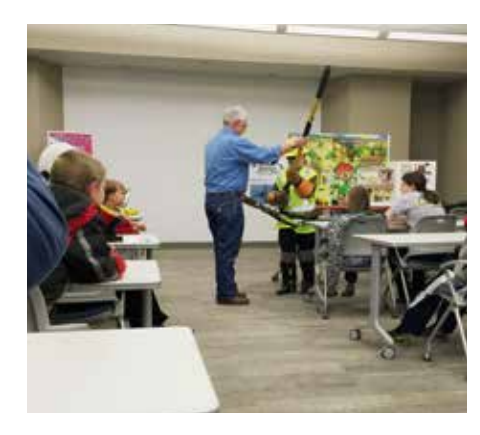
Here's how to schedule a session

A highlight of the presentation is dressing up a volunteer student (or teacher!) in the safety equipment that allows line workers to safely work on energized power lines. Each student also receives a special gift from Access Energy Cooperative.