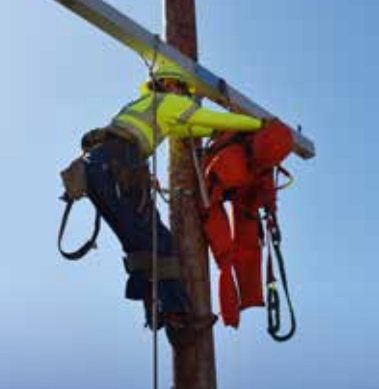
Steve Hyde, line worker, rescues a "dummy" lineman as part of pole top rescue training.