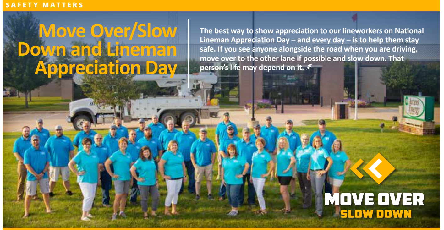
You may not hear them, but they are thanking you!

Access Energy Cooperative has been a part of the Youth Tour program for more than 50 years and currently selects two students each year to participate in the five-day trip. The students are selected through an application and interview process. F